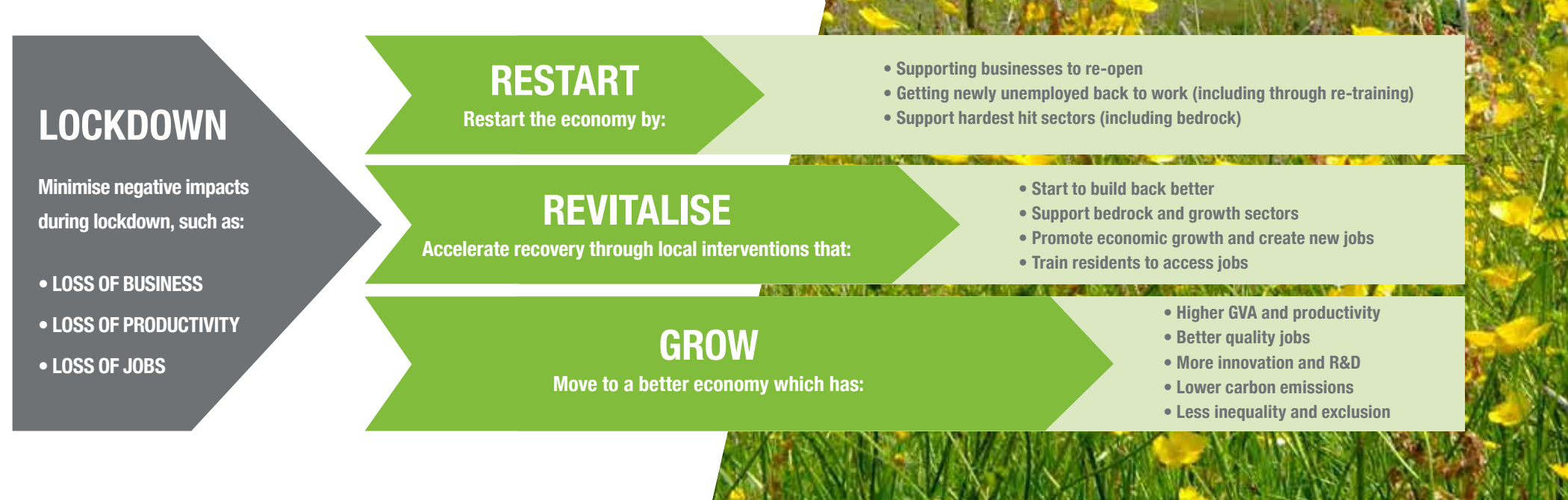
Figure 3. Phases of Recovery

As we moved out of the first national lockdown this focused on three phases to recovery that would enable us to re-start, revitalise and grow the economy which will be actively monitored and managed as the situation evolves. Our £35 million Getting Building Fund award from government marked a step on this journey but a step-change is now needed and this document sets out our pathway for the future.