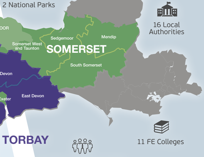
Figure 2. The Heart of the South West